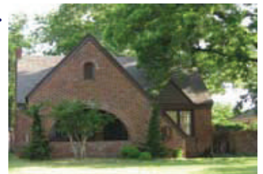
(SOS Amethyst House pictured above.)

services. During a 4 month minimum residency, tenants move through a phase system in order to earn privileges and progress through treatment. Amethyst House can accommodate up to 6 women at a time.